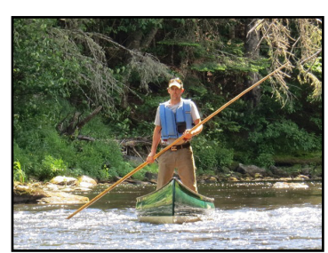
Canoe poling workshops and adventures