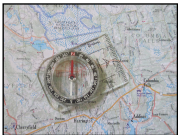
Basic land navigation skills