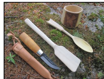
Basic knife and carving skills